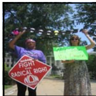
Holding the freedom chain in front of the Capitol building

Despite attempts to stifle the pro-choice voice of Mississippi, the actions of the Mississippi Reproductive Freedom Summer Coalition were a resounding success. Even after the kick-off rally was met with a bomb threat, pro-choice advocates simply turned the rally into a march around the Governor's Mansion. Throughout the week pro-choice protesters outnumbered anti-choice extremists at every turn.