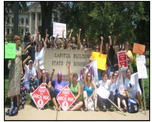
Protestors in front of the Capitol building in Mississippi left a lasting impression on anti-choice extremists